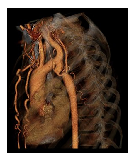
Figure 3 Computer tomography reconstruction of coarctation of the aorta.

cut-off value of 50 mm of the ascending aorta is used most commonly to define the patients at high-risk which should have surgery before pregnancy the same is true for severe aortic regurgitation as well as for severe aortic stenosis (42). However, BAV with aortopathy is most often asymptomatic and thus not known before pregnancy. Therefore, the most common clinical scenario is new diagnosis of BAV and/or aortic dilation during pregnancy. If severe valvular defects or aortic dilation above the cut-off of 50 mm is discovered by chance, the patient should have very close monitoring throughout the pregnancy with at least one visit during each trimester. Interdisciplinary discussion with the obstetricians should clarify whether the delivery of the child has to be done via caesarean section. From cardiological point of view, the indication for caesarean section is present in case of severe aortic stenosis or dilation of ascending aorta above 50 mm. However, every pregnancy should be evaluated individually, and some patients will decide for pregnancy despite high risk of cardiovascular events and have to be monitored and treated by an interdisciplinary team of various medical disciplines to ensure optimum therapy (42).