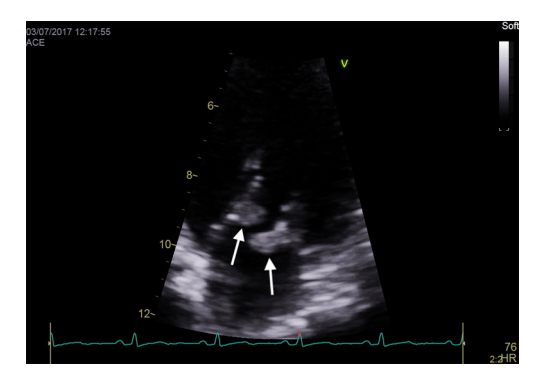
Figure 3 "Kissing vegetations" (arrows) on adjacent leaflets of the mitral valve typical of NBTE. NBTE, non-bacterial thrombotic endocarditis.

PVE it provides value in assessment of ventricular size and function, hemodynamic severity of valve lesions and in the diagnosis of anterior prosthetic aortic/mitral valve abscesses. Due to the shielding effect of prosthetic valves, abscess formation anterior to aortic/mitral valve is better visualized via TTE than TEE (1,11). TEE is indicated in almost all patients with suspected IE. For suspected NVE, TEE has a high sensitivity (>90%) and specificity (>90%) for detection of vegetations. TEE has been demonstrated to be superior to TTE for detection of complications such as perforations, abscesses and fistulae. In clinical practice TTE and TEE are used as complementary modalities to accurately diagnose and assess patients with suspected IE.