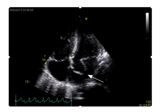
Figure 2 Apical four chamber view of a patient with confirmed tuberculous endocarditis with aneurismal perforation of anterior mitral valve leaflet (arrow).