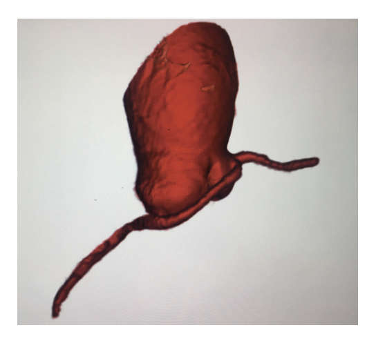
Figure 1 This illustrates the retroaortic course of the anomalous left circumflex coronary artery in immediate proximity to the aortic valve annulus.

stent) during valve delivery and deployment. Then a 3.5 \text{ mm} \times 38 \text{ mm} drug eluting stent was positioned within the guideliner catheter in the proximal anomalous LCX ( Figure 3 ). The guideliner catheter was left in place