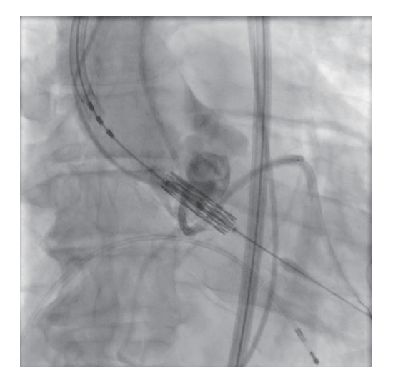
Figure 3 Aortic root angiography demonstrating the undeployed Sapien S3 valve in addition to the guideliner catheter and guide wire as well as stent in the anomalous left circumflex coronary artery and the guide catheter disengaged.

Cardiovascular Diagnosis and Therapy, Vol 10, No 2 April 2020