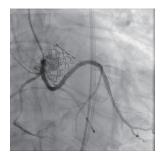
Figure 4 The Sapien S3 valve has been deployed and the guideliner catheter as well as stent removed with final selective angiography of the anomalous left circumflex artery.

report three cases of an anomalous LCX with a retro-aortic course without coronary compression (a balloon-expandable Sapien 3 valve was used for all three cases) (2). All patients were elderly and coronary calcium was noted on computed tomography (CT). It was proposed that the coronary calcium may have had a protective effect. However, our case shows that there appear to be more factors that determine the behavior of an anomalous LCX during TAVI because,