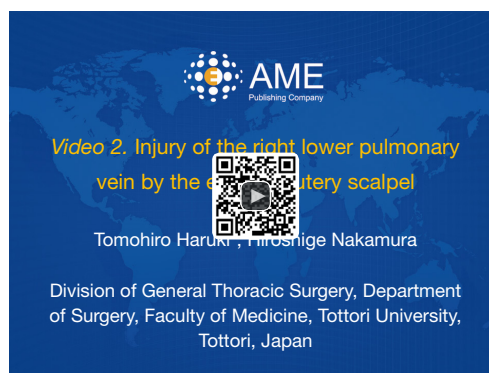
Figure 3 Injury of the right lower pulmonary vein by the electrocautery scalpel (6). There was a difficulty in controlling the bleeding because of extensive pleural adhesion. Having failed to apply the TachoSil® patch, we directly grasped the bleeding point by and sutured it interruptedly with 5-0 Prolene. Then we encircled the pulmonary vein and cut it with an endostapler safely. Available online: http://www.asvide.com/article/view/28189

thoracoscopic surgeries, and complete hemostasis can be achieved without the need for any sutures in most bleeding cases (Figure 2). Regarding repairing vessel injuries, Ikeda et al. reported that elastic fibers and smooth muscle had completely regenerated in the medial and adventitial layer of the pulmonary artery in female beagles by 8 weeks after TachoSil® patch (5). If we feel it is hard to achieve complete hemostasis even using TachoSil®, we should immediately convert to open thoracotomy. Also, in the situation of bleeding from the root of first branches of pulmonary arteries, we should never hesitate emergency conversion and immediately try to clamp proximal side of the main