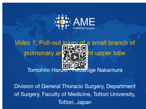
Figure 2 Pull-out injury of a small branch of pulmonary artery of right upper lobe (4). We applied TachoSil® patch to the bleeding point and complete hemostasis could be achieved without the need for any sutures.

Available online: http://www.asvide.com/article/view/28188