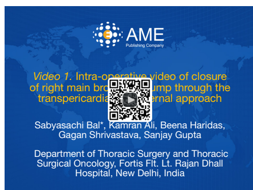
Figure 2 Intra-operative video of closure of right main bronchial stump through the transpericardial transsternal approach (10). Available online: http://www.asvide.com/article/view/28255

A midline sternotomy is made. The superior vena cava and aorta are mobilized and retracted after opening the anterior pericardium. Corrugated rubber drains are useful tools for retraction ( Figure 2 ). Ginsberg (2) advises tracheal mobilization before opening the anterior pericardium but this in our opinion is rarely required. We mobilize the trachea only if carinal resection is deemed necessary.