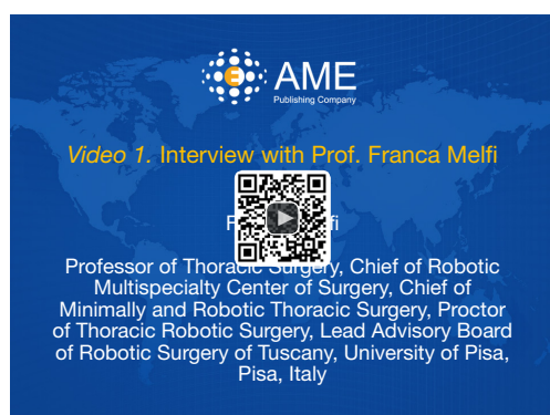
Figure 4 Interview with Prof. Franca Melfi (1).

Available online: http://www.asvide.com/article/view/28427