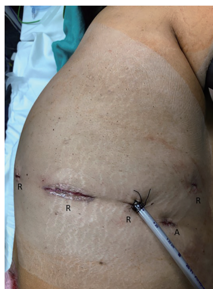
Figure 1 Visible here are the incision sites utilized for the chest portion of the esophagectomy; the robotic four (R) and one assistant (A). Most notable is the enlarged incision to accommodate the EEA stapler at the site of robotic arm two.

The first robotic esophagectomy was described in 2003, and the first robotic intrathoracic anastomosis was described in 2013 (5,6,9). Utilization of the EEA stapler for constructing the anastomosis in robotic esophagectomies has been previously described. Retrospective reviews of robotic esophagectomies, utilizing the EEA stapler for an intrathoracic anastomosis, demonstrated a 0–15% leak