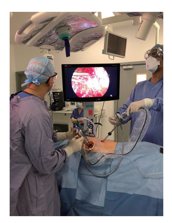
Figure 5 Operating room setting in a typical case of lower lobe segmentectomy.

to the dissection of the B1 segmental bronchus (after division of the A1 artery). The instrument used to dissect the bronchus deep and peripheral into the parenchyma and introduced from the utility incision may stretch and compress the A3 anterior branch of the PA which consequent risk of vascular injury. In addition, the A1 segmental branch should be divided distal to the origin of the A2 branch. To this purpose, this segmental vessel should be isolated very peripherally.