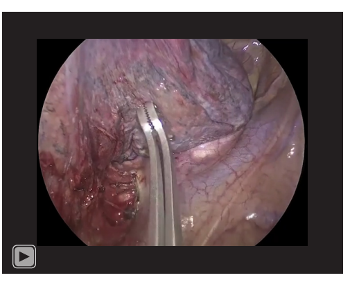
Video 1 Right biportal VATS apical segmentectomy (right S1).

or who underwent a previous lung resection and in whom sparing parenchyma appears convenient).