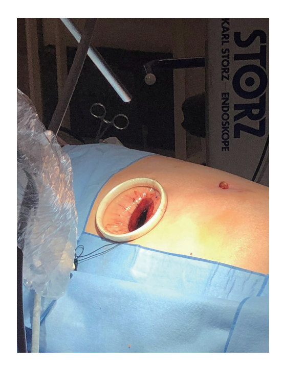
Figure 2 Left biportal VATS approach. VATS, video-assisted thoracoscopic surgery.