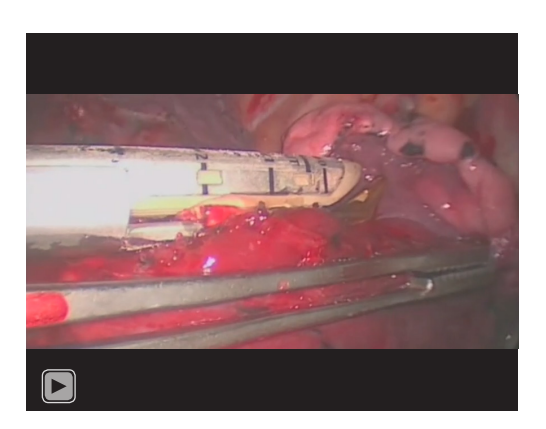
Video 3 Left biportal VATS posterior-lateral basal segmentectomy (LS9-10).

endostapler through the inferior port. Then the camera can be swapped into the inferior port to provide an excellent visualization of the fissure from below and the lingular branches of the pulmonary artery and lingular bronchus which need to be isolated and then divided with instruments and staplers usually introduced from the utility incision. Also, the intersegmental plane is generally divided with staplers introduced from the utility incision although like in every segmentectomy, the other port can be used if felt to provide a better angle.