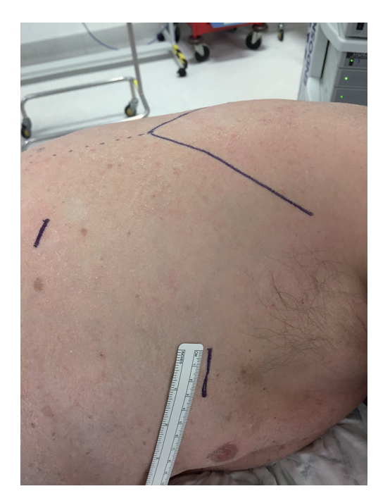
Figure 1 Right biportal VATS approach. VATS, video-assisted thoracoscopic surgery.