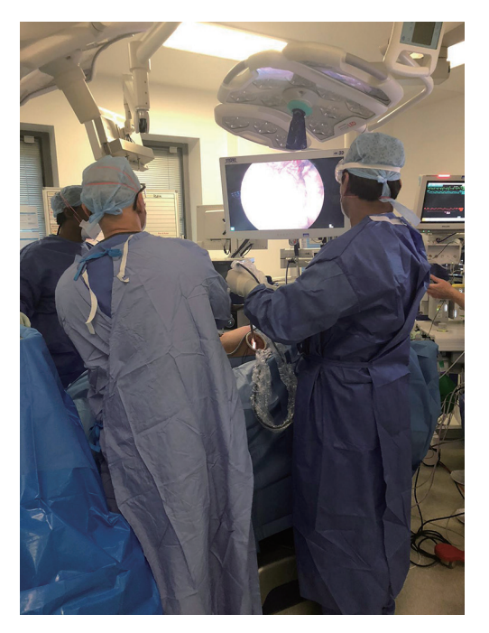
Figure 3 Operating room setting in a typical case of upper lobe segmentectomy.

incision (a combination of suction device, energy device and cautery, DeBakey dissector-330 mm long with a 7–10 mm shaft diameter). The endo staplers (EndoGIA Covidien or Echelon Johnson & Johnson) to divided vessels, segmental bronchus and the intersegmental planes are introduced either from the utility incision or the inferior port according to the best angle of exposure.