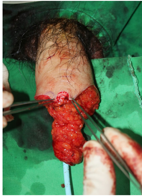
Figure 3 The status of the unresected and isolated neourethra after the penile tissue resection.