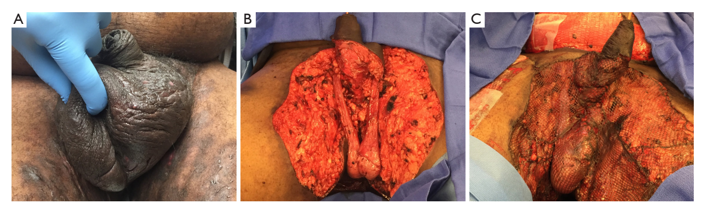
Figure 4 Hidradenitis suppurativa. (A) Refractory HS of the lower abdomen, penis, scrotum, and superomedial thighs; (B) wide excision of involved tissue; (C) immediate post-STSG with donor sites from anterior thigh and abdominal pannus. A mesh ratio of 1.5:1 allows the relatively small donor sites to cover the expansive wound base. STSG, split-thickness skin grafts; HS, hidradenitis suppurativa.

40% of the native, uninvolved scrotum needs to be present in order for the urologist to undertake primary closure. In these cases, our recommendation would be to utilize at least 2 to 3 layers of Dartos closure with absorbable suture prior to undertaking skin closure in an interrupted fashion. In most cases of primary scrotal wound closure, it is also our recommendation to leave a closed suction drain for a period of at least 3 days.