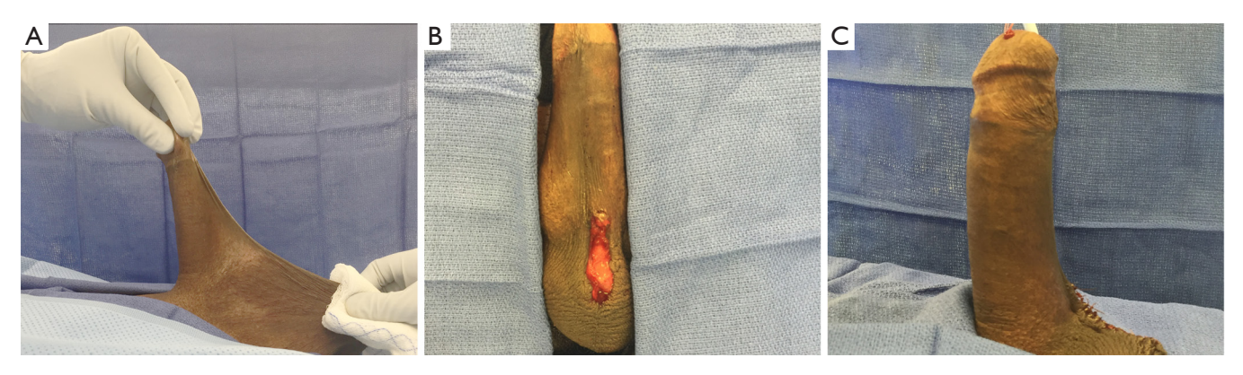
Figure 1 PSW. (A) Preoperative PSW with distal attachment of scrotal skin to ventral penile shaft; (B) VYFS. An inverted V-shaped incision is mobilized caudally and excess tissue is excised. The incision is closed in a longitudinal axis; (C) complete correction of PSW using VYFS at time of penile prosthesis implantation. PSW, penoscrotal web; VYFS, V-Y flap scrotoplasty.

the wound more prone to breakdown. The V-Y advancement scrotoplasty is another recently described contemporary maneuver to potentially avoid some of the limitations of the Z-plasty by maintaining the underlying blood supply. In this approach, a V-shaped incision with its apex at the penoscrotal junction is created, mobilized, and then closed such that a Y-configuration is formed by the suture line (21). Each time an advancement is formed, the length gained is approximately 0.4 times that of the vertical limb (21). At our institution, we perform a variation of the previous technique called a V-Y flap scrotoplasty (VYFS) in which the apex of an inverted V-shaped incision is oriented toward the urethral meatus and mobilized. As the inverted V is mobilized caudally, it can then be tailored, amputated, and closed in a longitudinal axis based on the severity of PSW (Figure 1). We stress a three-laver wound closure with great attention paid towards reducing any tension on the skin closure layer. In summary, we utilize two running layers of Dartos with a running 3-0 Monocryl (Ethicon, Inc., Piscataway, NJ, USA) suture, and skin with interrupted 3-0 Chromic catgut (Ethicon, Inc., Piscataway, NJ, USA) suture. We have found that performance of an interrupted skin closure rather than a running closure leads to less overall wound breakdowns as any tension on the wound is distributed over a number of individual sutures instead of on a continuous running suture line.