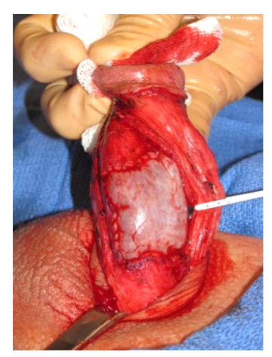
Figure 8 PEG procedure: Graft secured in place.

achieve symmetry (28). The pericardial graft (Tutoplast<sup>®</sup>, Coloplast, Humlebæk, Denmark) is then prepared on the back table. It should be rehydrated in a bacitracin solution prior to manipulation. The graft is tailored to be 2–3 mm longer than the measured defect. If the proximal and distal transverse aspects are different lengths, the graft is cut into a trapezoid to accommodate this discrepancy. At this point, orientation of the graft can be easily lost. To counter this, the graft should be marked with an arrow directed at what will become the distal border of the graft.