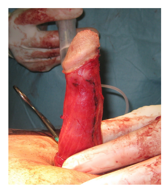
Figure 4 Sealing technique: Complete straightness of penis, result at end of surgery.

moistened with physiological saline for 3 s and then put on the defect. It is important that the fleece overlaps the defect at each side of at least 5 mm, the more the better. Importantly, the yellow side of the collagen fleece is put down to the tunica and the defect. Then it is manually molded over the defect and the tunica for 3 minutes until it sticks on the defect and the tunica. As this step is crucial for the Sealing technique, it is important to take some time for it. Importantly, exact adjustment and sewing in the defect, as performed with other grafts, can be omitted. The fleece has a stretching capability; therefore the risk for contraction is