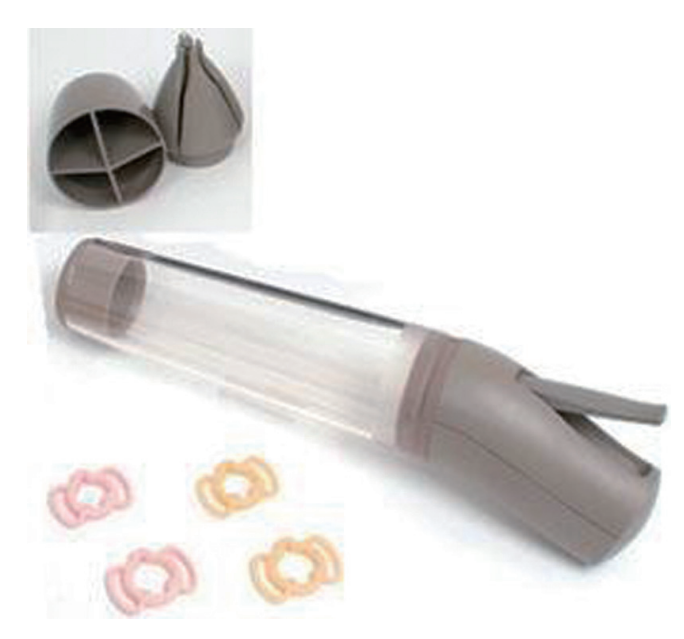
Figure 3 Osbon ErecAid vacuum therapy system

ErecAid vacuum pump for a twelve-week period [(21), see Figure 3 below].