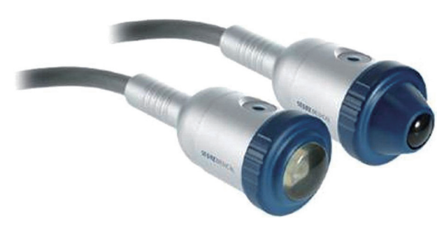
Figure 1 Storz Duolith SD1 ESWT system

be effective in subjective measures such as penile pain during erection and sexual function with no improvement in objective measures including plaque size and penile curvature (16). The improvement in pain symptoms is thought to be due to direct disturbance of pain receptors and hyperstimulation analgesia. This analysis was not without flaws as the meta analysis was only exploratory rather than confirmatory because of large differences in the subject medical history and symptoms severity between the study groups as well as inconsistent selection of outcome measures among the studies. At the time of publication there were no controlled, blinded studies performed. The first prospective, randomized, placebo-controlled trial was finally conducted in Italy by Palmieri et al. in 2009 [(17), see Figure 1 below]. Their 100 study patients were randomized to either 4 weeks of ESWL therapy or a non functioning transducer. Results mirrored earlier studies with significant improvement in pain scores on IIEF-5 questionnaires and QofL questionnaires. No statistical significance was found between plaque size or penile curvature between the two groups. However, there was a significant increase in both plaque size and penile curvature in the placebo group suggesting ESWL might be useful in halting plaque progression. In 2010 the International