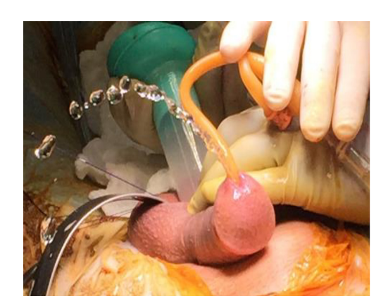
Figure 3 Intra operative irrigation revealing corpora-urethral fistula.