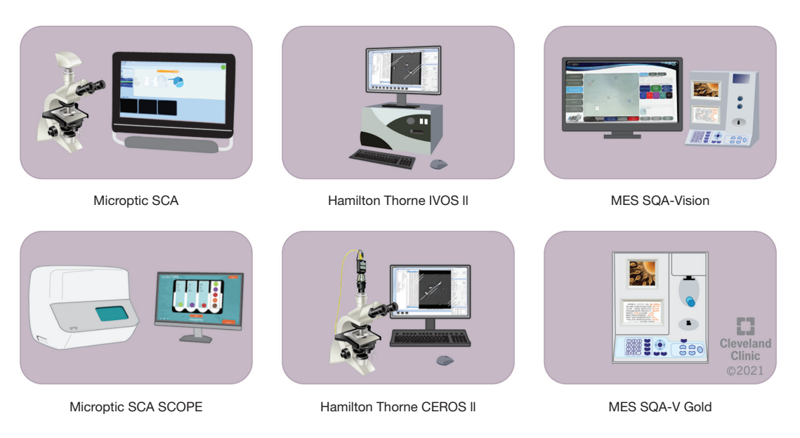
Figure 1 Graphic representation of the most commonly CASA systems used in Andrology laboratories. MES, medical Electronic Systems; SCA, Sperm Class Analyzer; SQA, Sperm Quality Analyzer.

the WHO (2010) guidelines is considered the first line and cornerstone of investigation (3,4). These guidelines provide laboratory procedures and reference thresholds for each semen parameter, including sperm concentration, motility, and morphology (4). As the evaluation is typically performed manually by a human operator, extensive training is required. However, the evaluation of microscopic parameters, including sperm concentration, motility, and morphology, is particularly prone to operator subjectivity, human error and intra-operator variability in results (5). These chances of error may affect the accuracy of results and therefore impact clinical decision making (5).