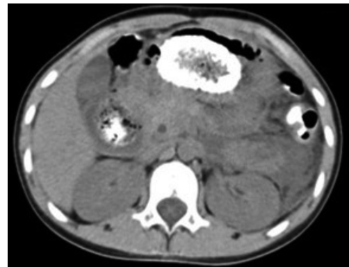
Figure 3 CT scan imaging. Plain scan imaging shows mixed high-density and gas-density masses in the gastric body and pylorus. CT, computed tomography.

The patient had an acute ill-looking and anemic appearance. Physical examination on admission revealed that the abdomen was distended, with guarding, rigidity,