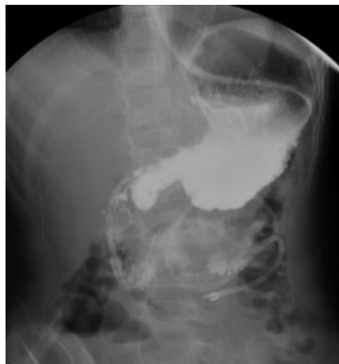
Figure 6 Postoperative gastrointestinal tract radiography imaging. No filling defect in the stomach or duodenum.

Considering the large size of the bezoar combined with acute necrotizing pancreatitis, the decision was to proceed with exploratory laparotomy, surgical removal of the bezoars, and intraoperative gastroscopy with the placement