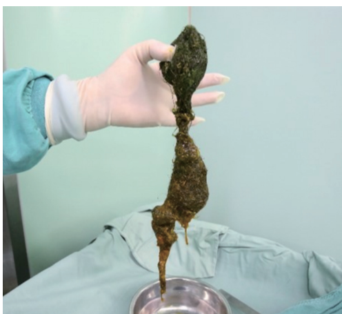
Figure 5 Surgical gross pathology. Foreign bodies such as hair and nails form a short “tail” distally.

of the pancreas. On the contrast-enhanced CT scan, the pancreatic tail was heterogeneously enhanced, and the left prerenal fascia was thickened ( Figure 4 ). CT examination confirmed the diagnosis of trichobezoar and acute necrotizing pancreatitis.