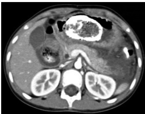
Figure 4 CT scan imaging. Enhancement scan imaging shows heterogeneous density and blurred margins of the pancreatic tail with blurred peripancreatic fat and fluid accumulation. CT, computed tomography.