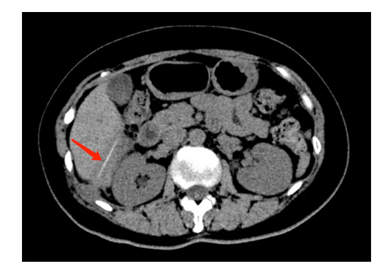
Figure 2 Abdominal CT scan showing a hyperdense linear foreign body occupying segment VI of the liver (see the red arrow).

that the foreign body may have penetrated the colon wall to reach the liver. When inflammatory malabsorption or adhesions to surrounding tissues occur, they can cause liver abscesses or adhesions to the surrounding peritoneum or organs, which in turn can cause specific symptoms secondary to systemic inflammatory reactions (e.g., anorexia, fever, and vomiting) (10). No bowel perforation was found in the present case. As there was very little damage, any wounds in the intestinal wall may have healed, and there may have been less adhesion.