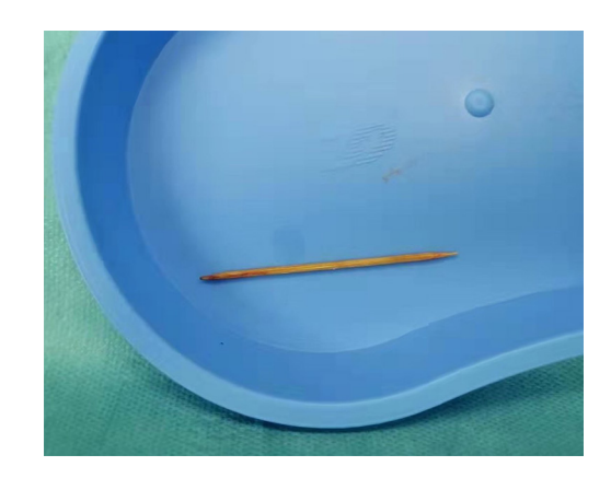
Figure 4 The bamboo toothpick that was removed from the patient's liver.

tests are not specific. If an object is not radiopaque, it cannot be detected (10). Thus, if foreign bodies, especially those made from wood or plastic, are suspected clinically, an ultrasound should be the first choice for the initial comprehensive liver scan (12,13). CT scanning has great diagnostic value because it provides high resolution and high precision imaging (5,10). Unlike in other cases, in the present case, the bamboo toothpick's surface had been painted and was thus clearly visible in the CT scan. Similar to previous findings in the literature, the foreign body's location can be found according to a CT image positioning prompt during the surgical presentation (5). Notably, in our CT reconstructed images, the relationship between the