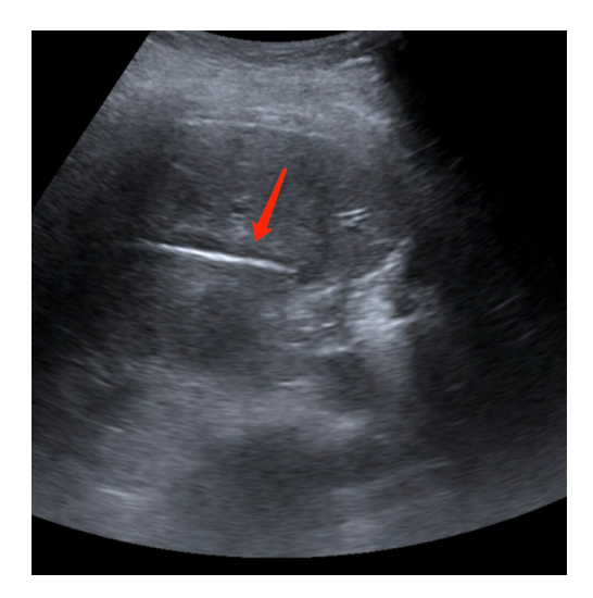
Figure 1 Ultrasound image showing a linear, highly reflective track in the right posterior lobe of the liver with sharp edges and no acoustic shadow (see the red arrow).

Li et al. Migration of bamboo toothpick to liver causing paroxysmal pain