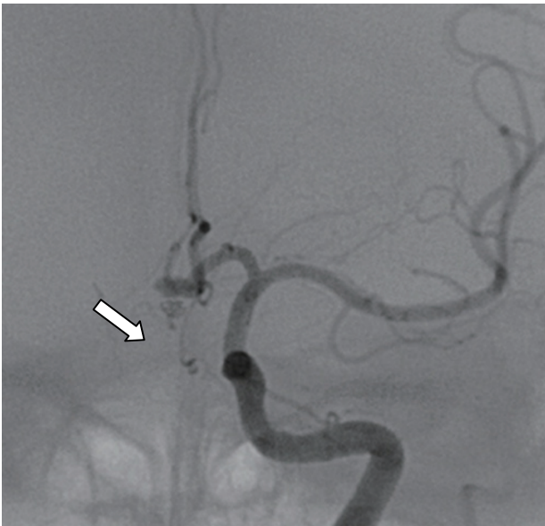
Figure 3 DSA reaffirms the existence of a small aneurysm and the patterns are consistent with the findings of the spectral CT angiography