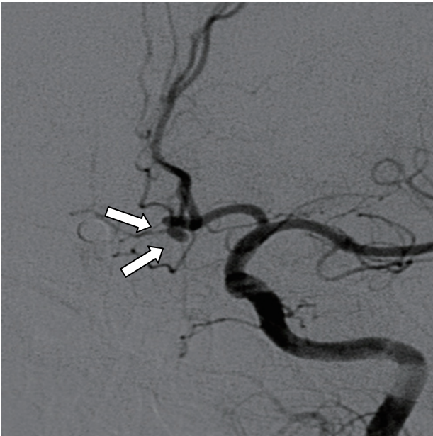
Figure 1 DSA shows an anterior communicating artery lobulated aneurysm