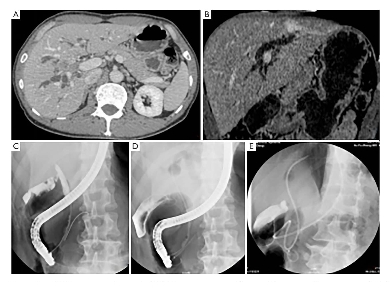
Figure 1 Single ENBD preoperative drainage for PHC. This patient, a 66-year-old male, had Bismuth type IIIa strictures caused by hilar cholangiocarcinoma. His initial serum bilirubin level increased to 12.2 mg/dL. One 7-Fr ENBD catheter was inserted into the left lateral bile duct (future remnant lobe), and the externally drained bile was replaced by a nasointestinal tube. His serum bilirubin level decreased to 2.0 mg/dL at 42 days post-ENBD, and he had undergone segments 1, 5–8 hepatectomy. (A) Axial computed tomography with contrast shows the mass in the right liver. (B) Coronal computed tomography shows dilated left bile duct. (C) Cholangiography contrast in the common bile duct shows the distal part of the structure. (D) Air cholangiography of the left intrahepatic duct. (D) ENBD drainage for left intrahepatic duct. ENBD, endoscopic nasobiliary drainage; PHC, perihilar cholangiocarcinoma.

enrolled into the ICC group). A cytology brush (Cytomax II, Cook Medical LLC, Bloomington, IN, USA) was then used for cytopathologic examination. After the targeted bile duct was cannulated, an endoscopic nasobiliary drainage (ENBD) tube (with or without plastic stent) was placed in the bile duct. The stents used were 7- and 8.5-Fr biliary plastic stents, and the drainage tube was a 7-Fr ENBD tube. In our institution, we prefer a unilateral ENBD to the future lobe as an initial preoperative drainage procedure with hilar cholangiocarcinoma ( Figure 1 ), a method that is accepted in Japan (7,11). For palliative treatment, a plastic stent (with or without ENBD) was implanted in the dilated