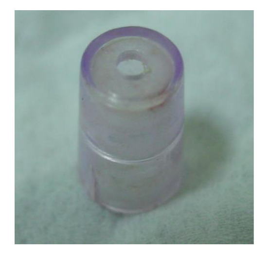
Figure 2 CTVE clearly shows the foreign body and its incarcerated site. CTVE, CT virtual endoscope.

Although many studies have confirmed MSCT can accurately diagnose bronchial foreign bodies (9-12).