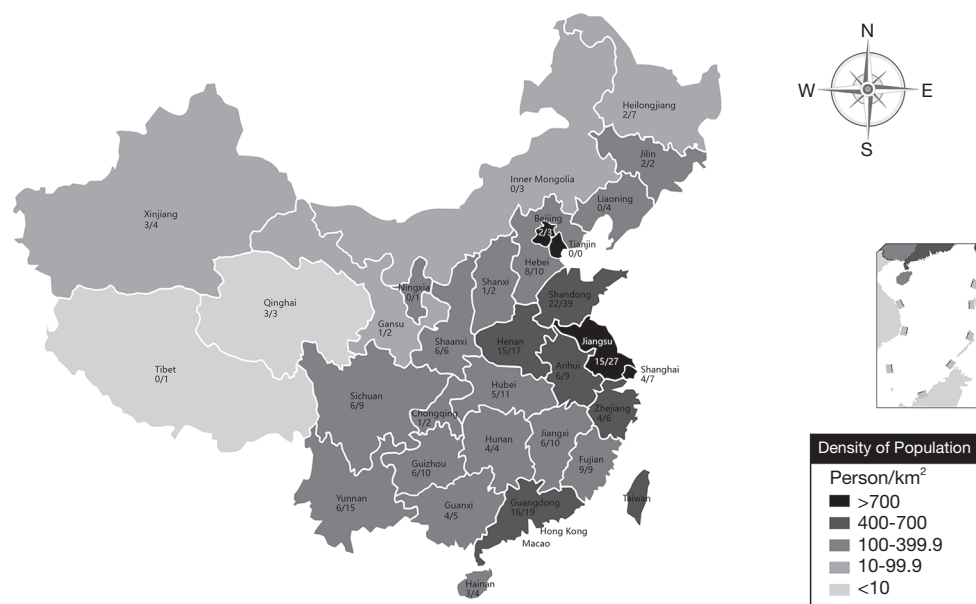
Figure 1 Geographic distribution of survey respondents. A grayscale map of China was divided into five levels depends on population density. The fractions represented the number of hospitals that participated in the survey (denominator) and the number of surveyed hospitals that provided EEG in the NICU (numerator) in each province. EEG, electroencephalography; NICU, neonatal intensive care unit.