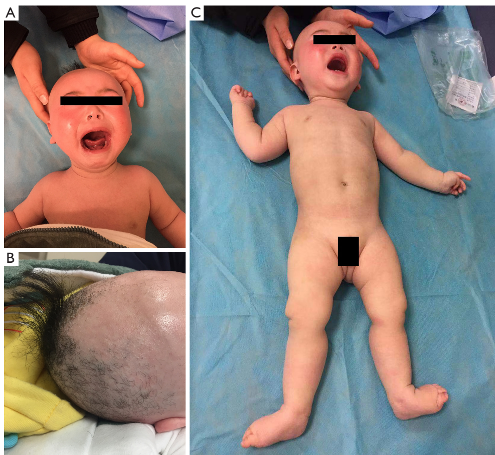
Figure 1 Photographs of the patient. (A) Facial appearance and alopecia. (B) Kinky and fragile hair. (C) Hypopigmented skin, joint laxity, and hypotonia.

the CARE reporting checklist (available at https://dx.doi.org/10.21037/tp-21-275 ).