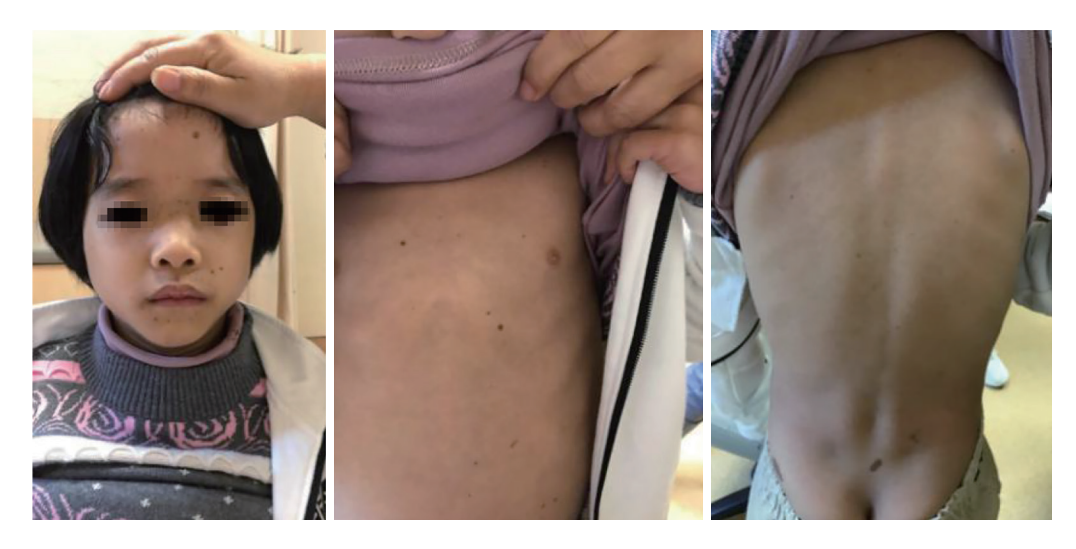
Figure 1 Physical examination of the child. This image is published with the consent of the patient's parents.

pathological murmur was observed in cardiac auscultation. The liver and spleen were not significantly enlarged under the ribs (see Figure 1 ). An auxiliary examination of the child showed normal magnetic resonance imaging results. The peak value of GH in the provocation test of arginine combined with levodopa was 16.93 µg/L and insulin-like factor IGF-1 was 69.19 µg/L, which fell within the normal range. Chromosome was XX, with no abnormality. Trace element content, thyroxine function, liver, and kidney function were normal, and a utero-ovarian B ultrasound showed no abnormality. The child was initially diagnosed with short-stature syndrome, which may be accompanied by gene mutation.