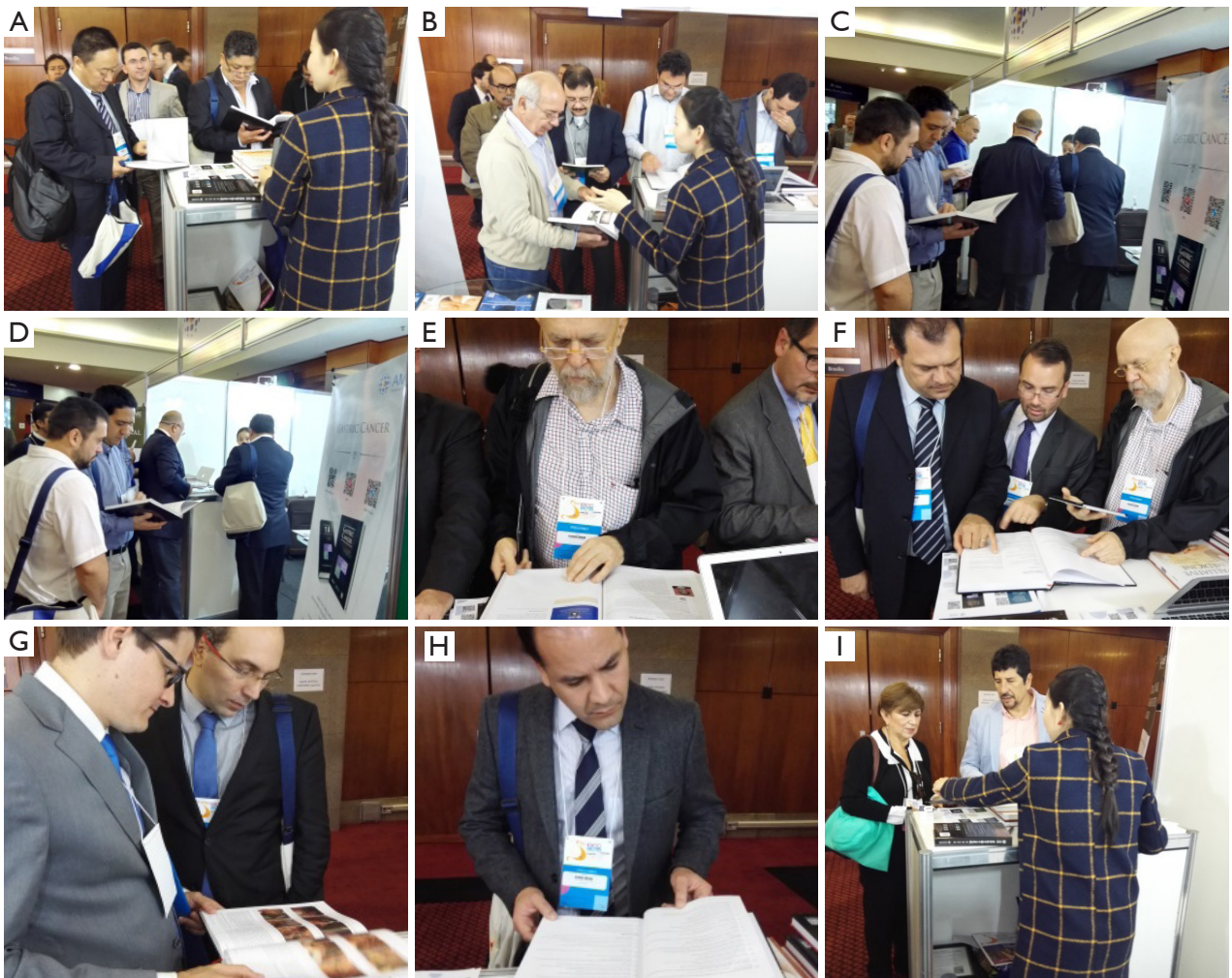
Figure 6 The readers of Gastric Cancer .