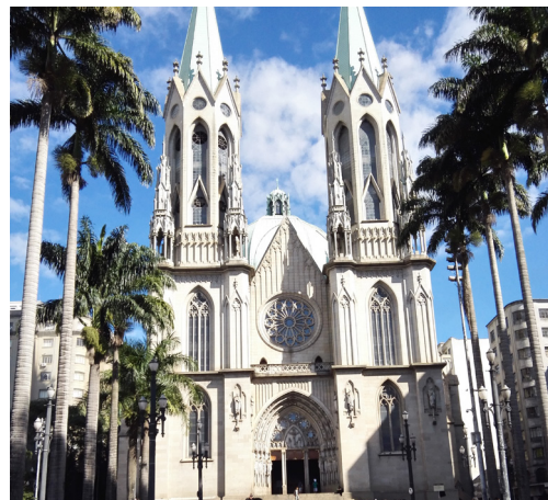
Figure 1 Catedral Metropolitana de São Paulo.

The most impressive thing was that the 3D surgical videos from the Chinese experts. Prof. Xiangqian Su showed