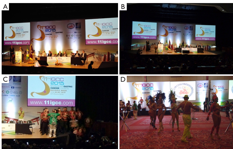
Figure 2 The opening ceremony.