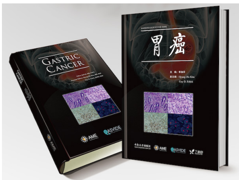
Figure 7 The book Gastric Cancer .