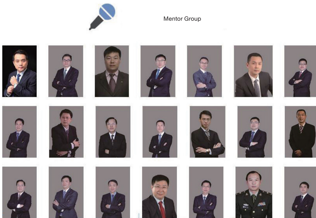
Figure 10 Mentor group.