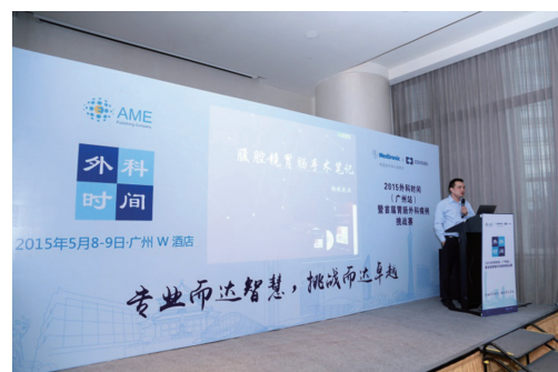
Figure 2 Prof. Li shared the story behind the creation of A Notebook on Laparoscopic Gastrointestinal Surgery .