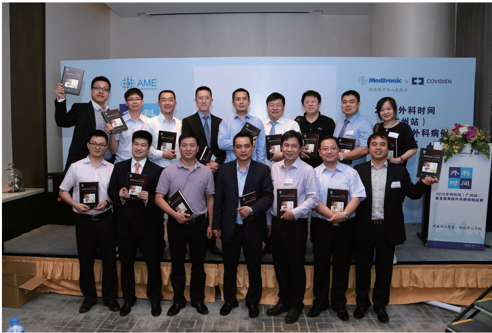
Figure 18 Iron Warriors group photo.