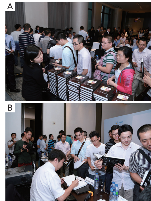
Figure 17 Signing and presentation ceremony.