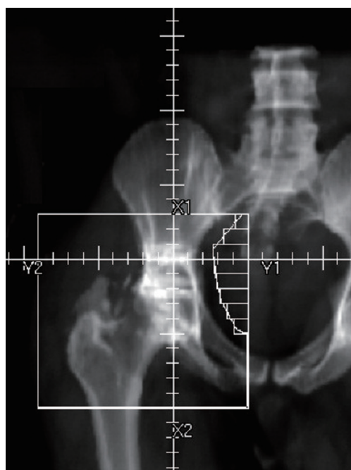
Figure 2 Treatment field.

much success. Additionally, given his poor functional status and the high risk of recurrence, the patient was advised to forgo any surgical interventions on the advice of several orthopedic surgeons. However, due to the severity of his symptoms, he was referred to the radiation oncology service for a trial of radiation treatment as a last resort for pain