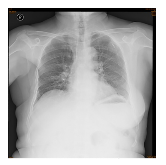
Figure 3 The catheter was disconnected at the neck back for 24 months after IVAP implantation (patient with 56 years old). IVAP, implantable venous access port.

Annals of Palliative Medicine, Vol 9, No 1 January 2020