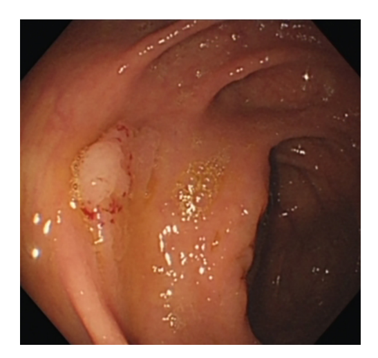
Figure 1 Colonoscopic examination showing a laterally spreading polyp in the ascending colon near the ileocecum.