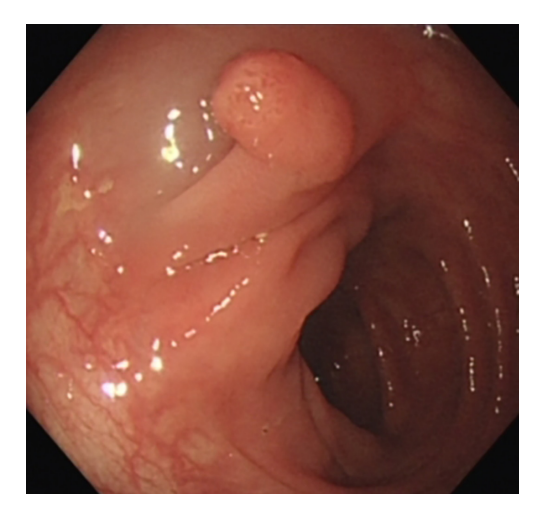
Figure 3 Colonoscopic examination showing an 8 mm pedunculated polyp in the transverse colon.

However, 96 h after colonoscopy, the patient had severe