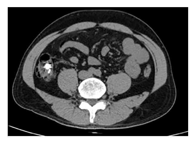
Figure 5 Absence of free air on the first abdominal CT scan.

bacteria were detected in the blood culture. No significant differences were found in other laboratory examinations (e.g., lactate, blood gas analysis, and hepatic function studies). According to the Sepsis-3 diagnostic criteria (9), the SOFA score in this patient was 4; therefore, the patient was diagnosed with sepsis and organ dysfunction.