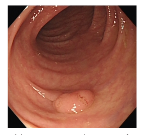
Figure 4 Colonoscopic examination showing a 4 mm flat polyp in the transverse colon.

lumbosacral pain, low blood pressure (approximately 80–86/50–56 mmHg, and mean arterial pressure 60–66 mmHg). Laboratory examinations revealed that the white blood cell count was 1.8 \times 10^9 /L, with 93% neutrophils, platelet count was 73 \times 10^9 /L, and serum creatinine was 133 µmol/L (37 µmol/L higher than 48 h before), with increased inflammation markers including high-sensitivity C-reactive protein which was 66.4 mg/L and procalcitonin which was 38.63 ng/L. Changes in coagulation functions were observed as follows: prothrombin time: 15 s, antithrombin: 57%, international normalized ratio: 1.36 R, activated partial thromboplastin time: 40.5 s. Gram-negative