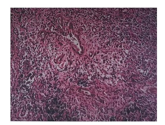
Figure 1 Pathology of lymph node metastatic adenocarcinoma on July 23, 2018 (H & E staining, ×400).

history of smoking or alcoholism. There was also no family history of genetic disease.