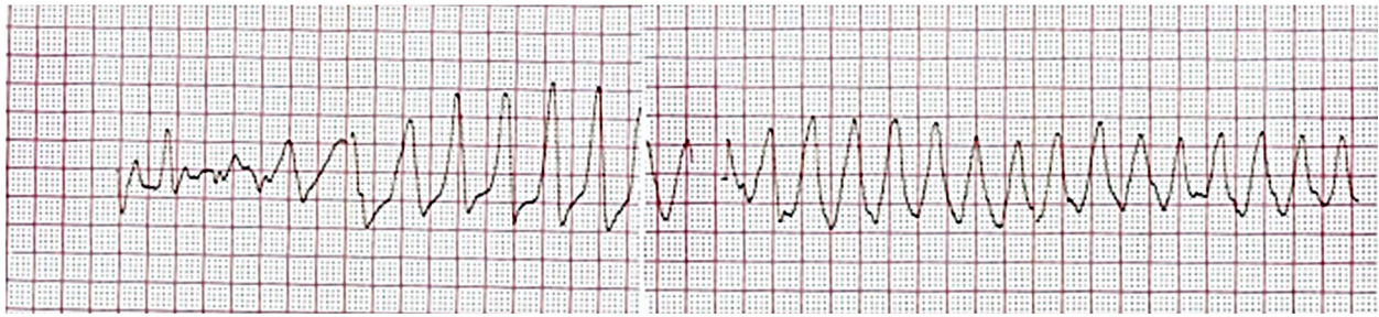
Figure 2 Electrocardiogram showing the atrial fibrillation with rapid ventricular response and corrected QT interval was 486 msec.