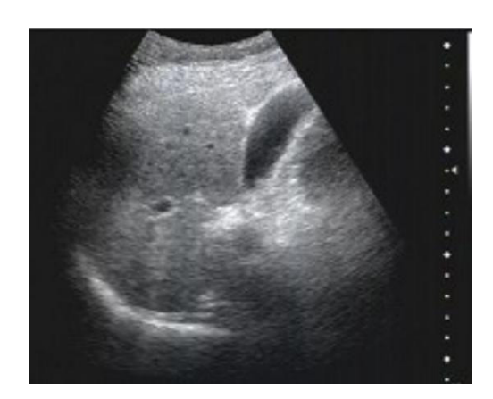
Figure 1 Abdominal ultrasound: chronic liver disease, splenomegaly.

A 68-year-old female with left upper abdominal mass for the past 6 years and loss of appetite for half a month, was admitted to The Lianshui County People's Hospital, China, on May 11, 2019. The left upper abdominal mass was not