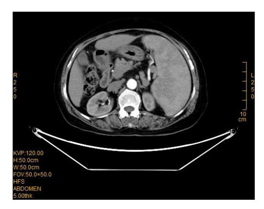
Figure 2 Abdominal CT scans: small round low-density shadows in the spleen and liver; intrahepatic bile ducts, splenic varices and portal veins were wide; splenomegaly.

treated because of no apparent aches. Half a month ago, the patient suffered from anorexia and palpitations, shortness of breath, dizziness, and fatigue during physical activities. The patient did not feel chest pain, hematemesis, melena, abdominal pain, abdominal distension, urinary urgency, frequent urination, or painful urination. After accepting relevant examinations, she was diagnosed with splenic hyperfunction and thrombocytopenia and was hospitalized. The patient had no significant weight loss owing to the illness. The patient had a history of Sjogren's syndrome and hypertension but was not under regular treatment. She had no history of infectious diseases, diabetes, heart disease, drug and food allergies, and surgery or blood transfusion. The clinical examination of the patient did not reveal obvious abnormalities, excluding splenomegaly more than 3 cm below the costal arch. The auxiliary examination was as follows.