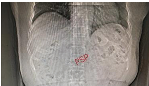
Figure 3 Representative CT images after PSP treatment 2. CT, computed tomography; PSP, pancreatic stent placement.

and nitroglycerin can reduce the pressure on the sphincter of Oddi (27). In this study, the two drugs were prophylactically administered to patients undergoing ERCP, and their preventive effects on pancreatitis and hyperamylasemia were observed. Under the same set of treatment factors, no significant difference was found in the incidence of hyperamylasemia in the indomethacin + nitroglycerin group, and the PSP group. However, the incidences of PEP were lower than that in the placebo group, and the incidence of PEP in group the indomethacin + nitroglycerin group was lower than that in group the PSP group. Moreover, the grading of severity of PEP in the indomethacin + nitroglycerin group was lower than that in group the PSP group ( Figures 2 and 3 ).