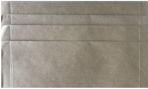
Figure 1 Pre-made envelopes containing the allocation intervention.

history of liver cirrhosis, upper gastrointestinal ulcer, or upper gastrointestinal bleeding; (IV) patients with allergies to contrast agents or unable to tolerate somatostatin or nitroglycerin; (V) patients with mental disorders or illnesses; (VI) patients taking pancreatic toxic drugs (e.g., estrogen, azathioprine, mesalazine, morphine derivatives, or prednisone) or angiotensin receptor blockers; (VII) smokers.