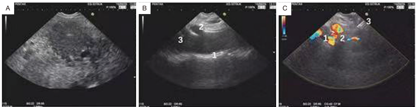
Figure 1 Endoscopic ultrasonography-guided celiac plexus neurolysis imaging. (A) Pancreatic solid mass. (B) 1, abdominal aorta; 2, celiac trunk; 3, superior mesenteric artery. (C) 1, abdominal aorta; 2, celiac trunk; 3, aspiration needle.

(14,15). Patients meet criteria: (I) VAS score within 6 hours after CPN greater than preoperative score; (II) VAS score after 24 hours less than preoperative score; (III) ruling out other diseases leading to pain exacerbation were recognized cases with postoperative procedure-related pain. Time-varying narcotic medication including opiates kinds and dosage was documented from pre-CPN 1 week to 1 week after the procedure. To standardize pain palliation medication usage, the dose was converted to an equianalgesic dosage (mg/day) of orally administered morphine according to established standards (8).