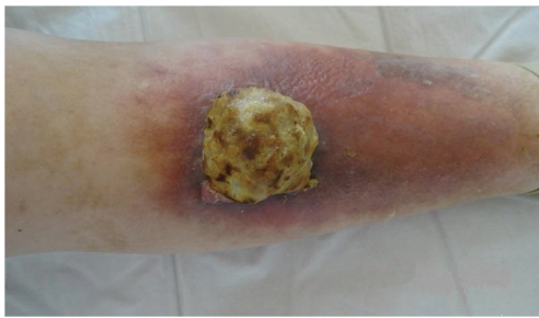
Figure 1 Lesions on the right tibia. A nodule, 2.4×2.5 cm in diameter, with scattered ulcers, a purulent scab, and a light-yellow discharge was surrounded by slightly swollen and red-brown patches on the right tibia.

of skin cancer. An MCC in a liver transplant recipient was first reported by Esen et al. in 2005, and to the best of our knowledge, there are only four patients with MCC after liver transplantation described in the English literature (2-5). Indeed, this is the first case of MCC after liver transplantation reported in the English literature involving a Chinese patient.