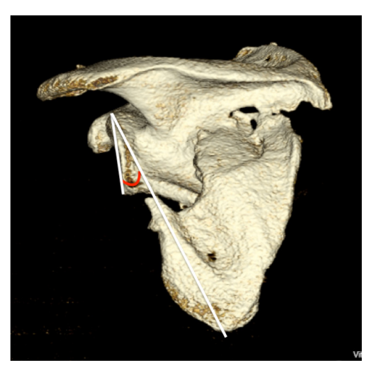
Figure 4 Measurement of the glenopolar angle performed on a three-dimensional computed tomography (3D CT) oriented in the coronal scapula plane. The glenopolar angle measurement is made by drawing a line from the inferior to the superior pole of the glenoid fossa and another line from the superior pole to the apex of the scapula's body's inferior angle.

surgical approaches and fixation strategies.