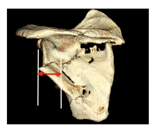
Figure 2 Measurement of the lateral border offset is performed on a three-dimensional computed tomography (3D CT) oriented in the semicoronal scapula plane. The common displacement pattern is for the inferior scapula fragment to lateralize in relation to the superior fragment. The lateral border offset is measured drawing a line from the lateralmost extent of the inferior fragment and another perpendicular line from the lateralmost aspect of the superior fragment.