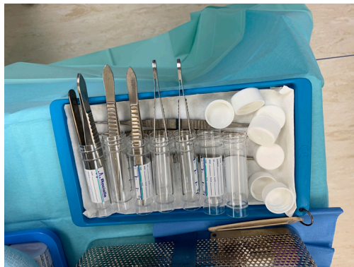
Figure 1 Standard sampling tray. A clean forceps and knife are used for each individual sample to minimize risk of cross-contamination.

the technical aspects of DAIR procedure with particular reference to hip and knee arthroplasty. The principles can be applied to any PJI as the basic principles are universally applicable. We will also cover joint specific issues in hip and knee arthroplasty.