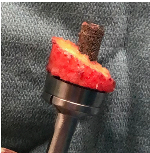
Figure 2 Autograft bone with reverse total shoulder replacement.

loss where adequate version correction and secure seating of a glenoid component are difficult to attain. For larger defects, structural grafts are needed in order to stabilize the glenoid component. Both autografts and allografts are commonly used to treat GBL. The proximal humeral head provides an excellent option for local bone graft when addressing GBL (42). Once the humeral head is resected, the size of the humeral autograft can be determined based on a preoperative template. The glenoid is prepared and all remaining cartilage is removed until an appropriate bleeding bone bed is created. This can be done utilizing a combination of curet and burr. The resected humeral graft can then be secured to the glenoid with Kirschner wires for temporary fixation, while the baseplate is secured with a central post opening in the graft. Further fixation is then obtained with screws through the baseplate (refer to Figure 2 ) (16). In cases in which humeral head autograft is not available, such as in revision or traumatic settings, an iliac crest bone graft is another option to address GBL. Many published studies evaluating RSA with glenoid bone grafting for both primary and revision cases present satisfactory outcomes (13).