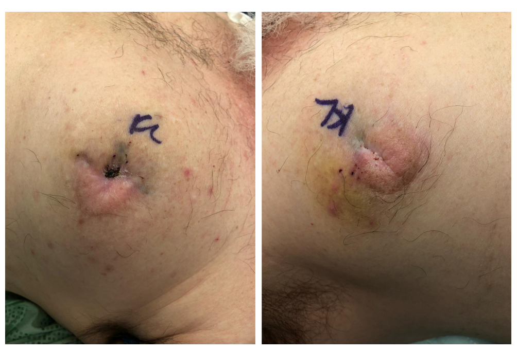
Figure 1 Initial consultation photographs of our patient's left and right breast prior to bilateral mastectomy for suspected necrotizing soft tissue infection.