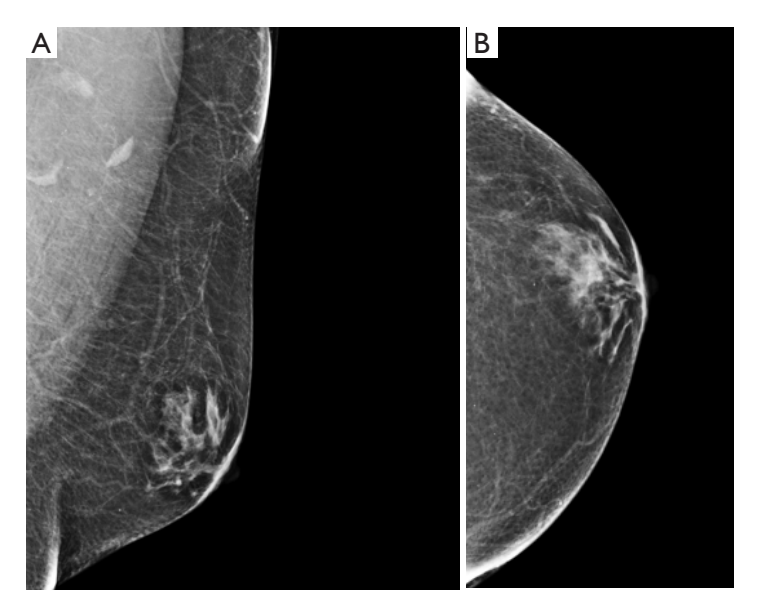
Figure 1 A 65-year-old man with retroareolar gynecomastia demonstrated on these mammogram images showing a classic flame-shaped retroareolar mass with indistinct borders blending into the surrounding adipose tissue on the left breast MLO (A) and left breast CC (B) view.