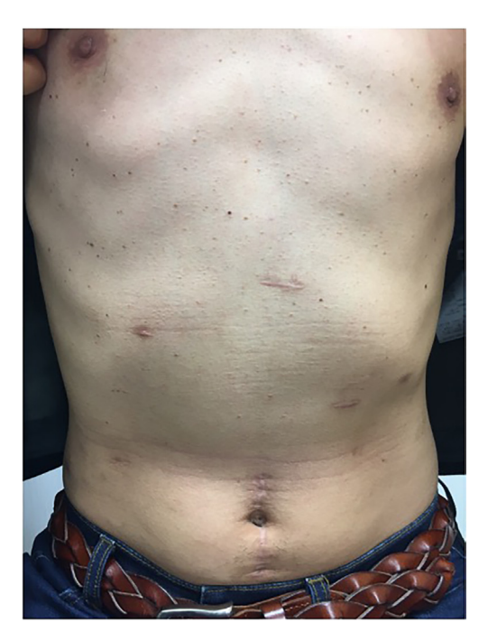
Figure 2 Appearance of the postoperative scar 6 months after surgery.

parenchymal transection, it is also possible to transect the parenchyma with clamping posterior Glissonean pedicle as an inflow occlusion.