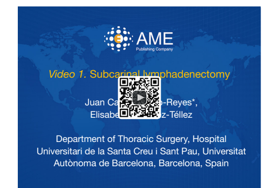
Figure 5 Subcarinal lymphadenectomy (16). Available online: http://www.asvide.com/article/view/32079