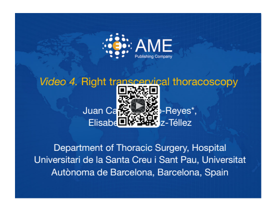
Figure 10 Right transcervical thoracoscopy (19). Available online: http://www.asvide.com/article/view/32082

Figure 8 The 5 mm 30° video-thoracoscope is introduced through the valves of the video-mediastinoscope.