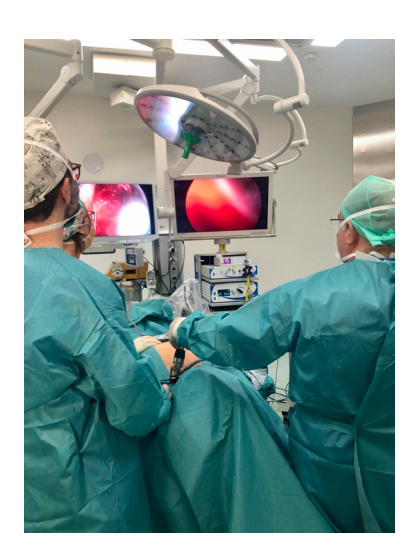
Figure 9 Using two screens during the exploration.