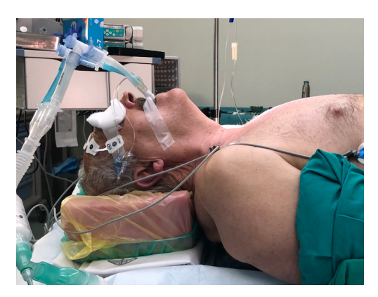
Figure 1 Patient's position.