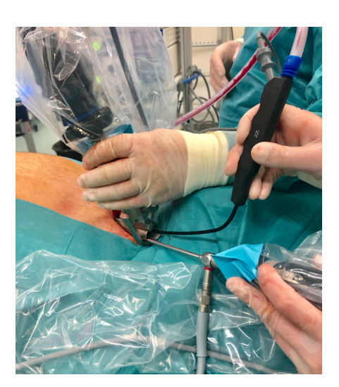
Figure 8 The 5 mm 30° video-thoracoscope is introduced through the valves of the video-mediastinoscope.