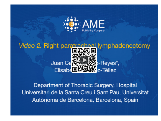
Figure 6 Right paratracheal lymphadenectomy (17). Available online: http://www.asvide.com/article/view/32080

Subcarinal nodes are completely excised following the