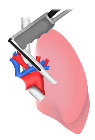
Figure 11 Video mediastinoscope is inserted and advances in front or behind the left innominate vein.

After removing the right inferior paratracheal lymph nodes, the mediastinal pleura is grasped and incised. The ipsilateral lung is collapsed and the video-thoracoscope is introduced to the pleural cavity. With a second screen connected to the video-thoracoscope, the entire pleural cavity is explored. The parietal or visceral pleura and lung nodules if present can be biopsied. The opening of the twovalved video-mediastinoscope even allows the insertion