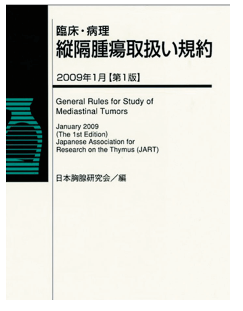
Figure 2 Cover of "General Rules for Study of Mediastinal Tumors".