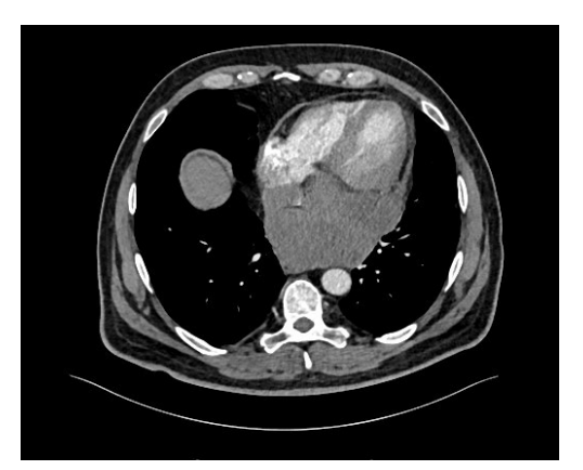
Figure 4 CT shows a 120 mm undifferentiated round cell sarcoma with compression of the inferior vena cava and left atrium. CT, computed tomography.