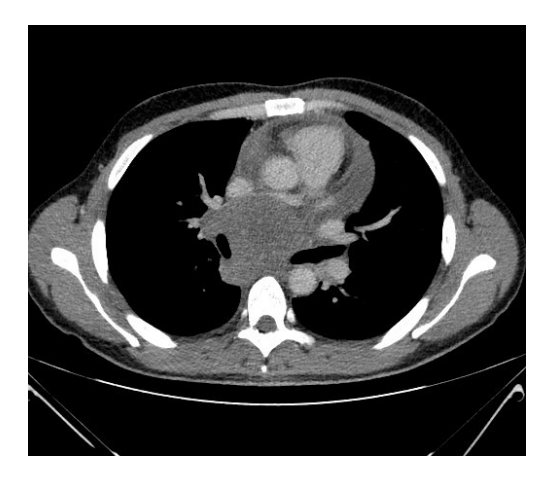
Figure 2 CT shows an 84 mm synovial sarcoma located anteriorly and inferiorly to the tracheal carina, compressing the right pulmonary artery. CT, computed tomography.