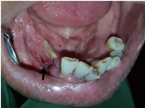
Figure 2 Osteoradionecrosis. The mandibular alveolar mucosa where teeth were post-radiation extracted is largely ulcerated, revealing a typical exposed necrotic bone in an irradiated patient with head and neck cancer (an arrow). Moreover, the incisal edges of the mandibular anterior teeth are torn away.

initiated. In general, determination of the extent of jaw resection is based on the presence of bleeding at the surgical edges. Recurrences of ORN can occur even in cases where adequate resection is performed. Long-term follow-up of patients with ORN is, therefore, mandatory.