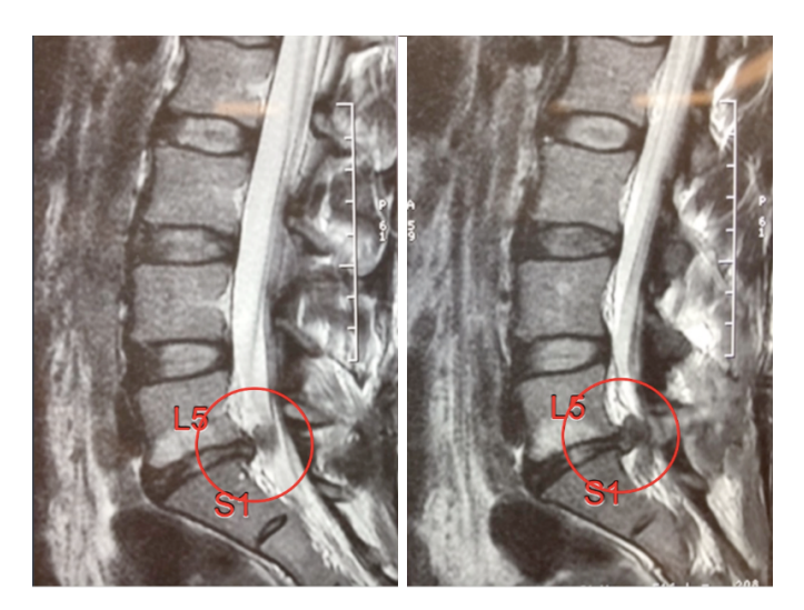
Figure 1 Recurrent disc herniation L5/S1 with Modic endplate changes and loss of disc height.