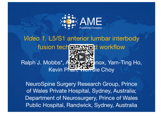
Figure 2 L5/S1 anterior lumbar interbody fusion technique and workflow (6).

Available online: http://www.asvide.com/articles/1750