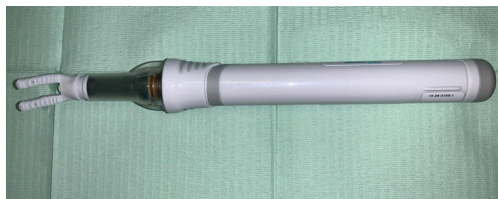
Figure 7 Cordless oscillating system with moveable prongs for one-time patient use.

This system is based on the Gate Theory of pain and the limited capacity of the body to perceive many stimuli at once (46-48). The system includes a rechargeable unit that uses a disposable tip to retract and provide light and oscillation of the tissue during injection. The use of disposable tip helps reduce risk of intraoral needlestick injury by removing the retracting finger from the intraoral mucosa (49-51). For OHP, the Dental Vibe allows for instrument rather than finger retraction while administering local anesthesia, which has been proven to lead to less needlestick injury, particularly in newer practitioners who have less local anesthesia experience (51-53). The oscillating vibrations send pulsations deep into the tissue to stimulate firing of alpha fibers and distract the patient from needle insertion and the pain (48,49,54,55) (Figure 6). Currently, there are several institutions in the United States using the Dental Vibe (Figure 7) in clinical application while others are teaching use of instrument retraction in preclinical teaching and clinical application.