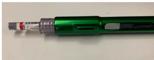
Figure 5 View of sodium bicarbonate cartridge for Onset Buffering Pen System ® .

maximize water solubility and chemical stability. Some of the acidic form of this local anesthetic must be deionized to penetrate the lipid bilayer, enter cells, and become effective. While it takes some time for the body to naturally buffer injected acidic local anesthetic solution, buffering can