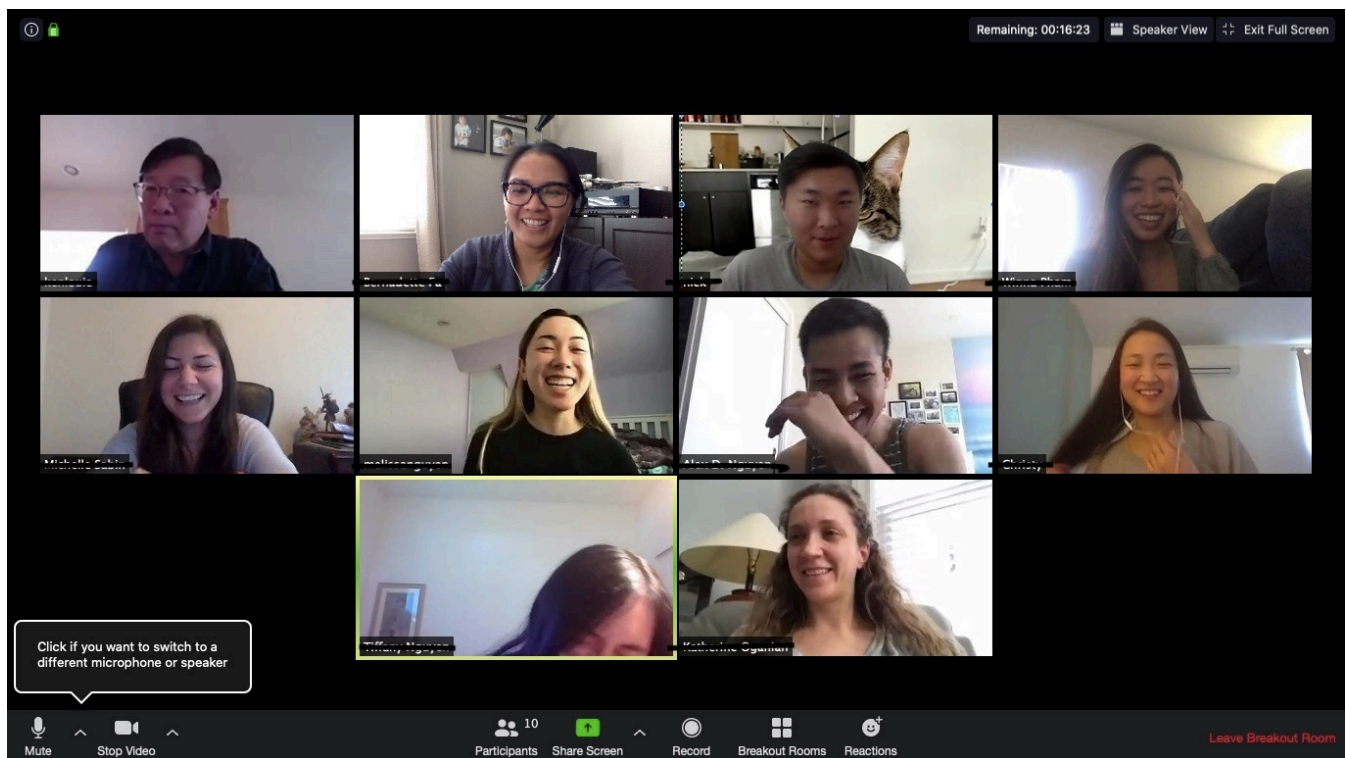
Figure 1 Small Group Zoom® Break Out Sessions (this image is published with the participants' consent).