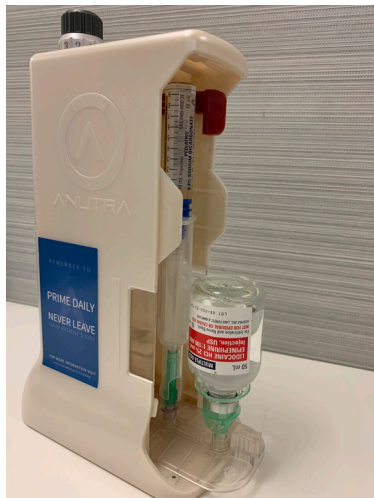
Figure 3 Anutra ® Medical Buffering system.