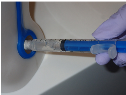
Figure 4 Anutra ® Medical haptic syringe.