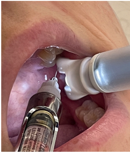
Figure 6 Dental Vibe® system used in delivery of mandibular block technique.