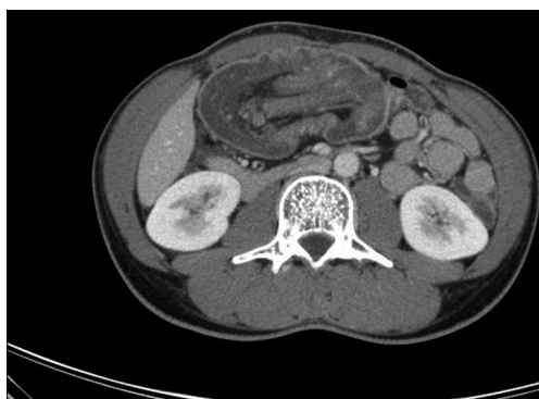
Figure 2 Typical CT-scan of an ileocolic invagination (sausage shaped lesion).