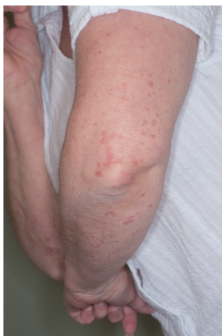
Figure 2 Maculopapular rash in upper limbs.

palpable, maculopapular lesions on the bilateral upper and lower extremities, more prominently in the lower limbs ( Figures 1,2 ). The patient denied any systemic symptoms, specifically fever; a review of the system was positive for dysuria. Initial blood work, including a complete blood count and liver function test, was within normal limits. Based on the physical examination, vasculitis was suspected and a punch skin biopsy was obtained. Histopathologic examination revealed skin with a vasulocentric inflammatory infiltrate comprised of neutrophils, lymphocytes and histiocytes with associated dermal hemorrhage (purpura) and fibrinoid necrosis of the vessel wall and leukocytoclasia, confirming the diagnosis of leukocytoclastic vasculitis ( Figure 3A,B ). Given the patients dysuria, a urinalysis (UA) was obtained to rule out systemic/renal involvement. The UA was positive for leukocyte esterase, white cells 12 WBC per high power field (HPF) (normal, 0-2), and 4 RBC per HPF (normal, 0-2). There was no evidence of proteinuria or RBC casts. Urine culture