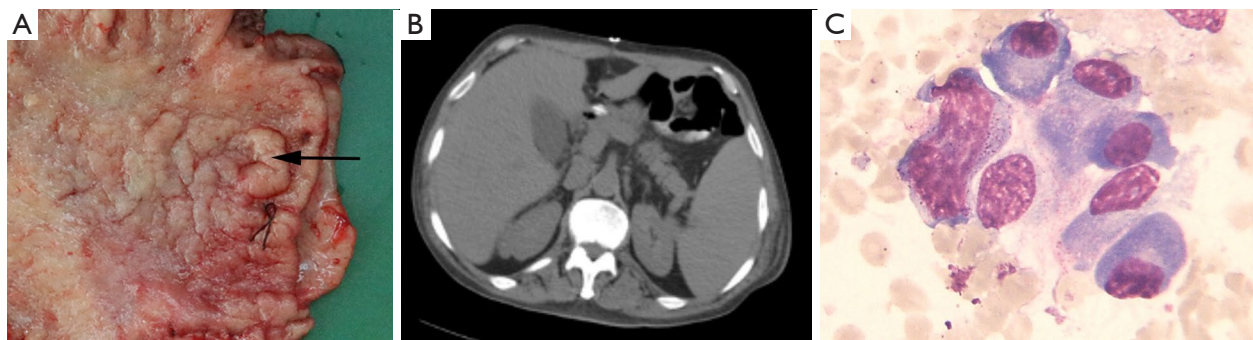
Figure 1 Clinical information of case 1. (A) Surgical specimen of case 1, the black arrow represents gastric cancer. (B) CT image after surgical resection showing enlargement spleen. (C) Wright-Giemsa staining of bone marrow biopsy showing hemophagocytosis (original magnification: \times 100 ). CT, computed tomography.