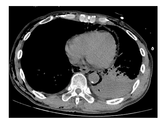
Figure 1 Computed tomography of the chest demonstrating pneumomediastinum, left pneumothorax, and left pleural empyema.

Journal of Thoracic Disease, Vol 8, No 12 December 2016