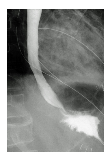
Figure 4 Barium swallow on the postoperative day 7 confirms the absence of any leak or stenosis at the site of the esophageal repair.

Journal of Thoracic Disease, Vol 8, No 12 December 2016