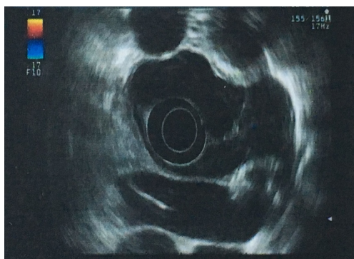
Figure 2 Endoscopic ultrasonography (EUS) revealed the well-circumscribed, hypoechoic mass originated from the muscularis propria layer.