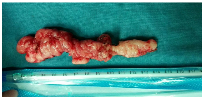
Figure 5 Operative specimen.

on the 1 st postoperative day, with following solid meal and the patient was discharged on the 8 th postoperative day in the absence of any postoperative complications.