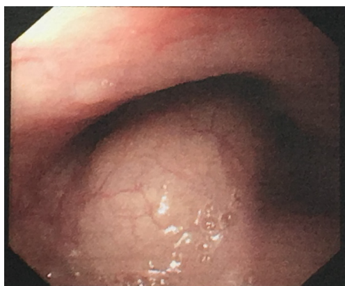
Figure 1 Upper gastrointestinal endoscopy revealed a mucosal protuberant lesion at 25–30 cm from the incisor teeth and a normal, smooth esophageal mucosa.